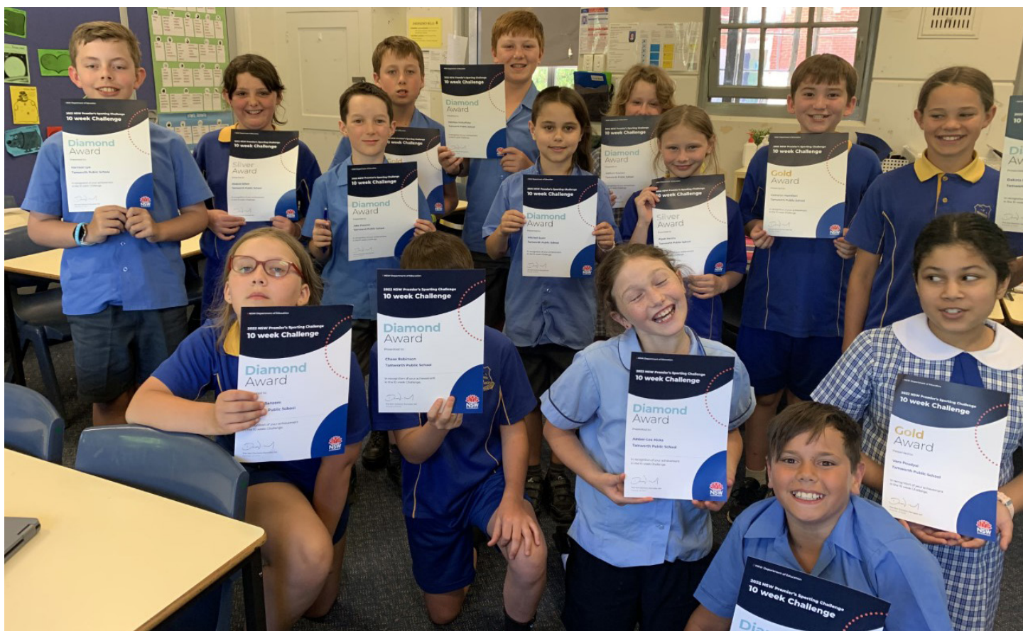
4R Receive Awards for Premier's Sporting Challenge